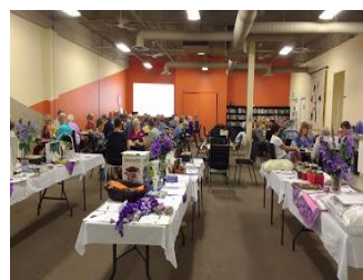
Thanks to all who donated and bid on the wide array of treasures.