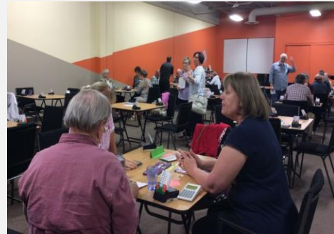
Thanks to all the bridge masters who guided the rookies in strategies for team play.