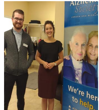
The Alzheimer Society of London and Middlesex spoke with our LBC community.

On Wednesday June 19 th , the London Bridge Centre held its Day of Bridge event in support of the Alzheimer Society of London and Middlesex . Not only did the club host five sessions of bridge, but with our members' generosity, we raised over $7,600 for the local chapter of the Alzheimer Society.