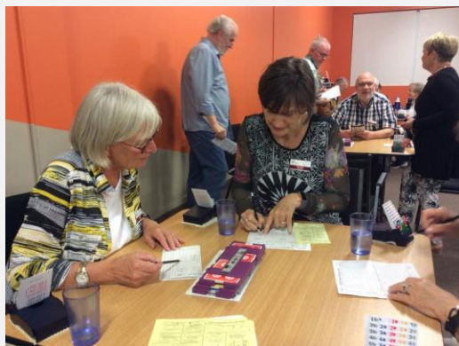
Rookies learned how to score.