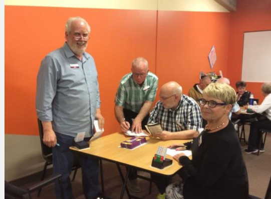
And we all had a great time!

For up to date information, visit the LBC website: www.londonbridgecentre.ca