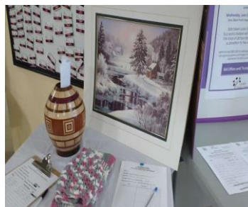
A wide range of items were offered.