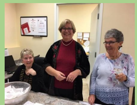
Thanks to everyone who helped.