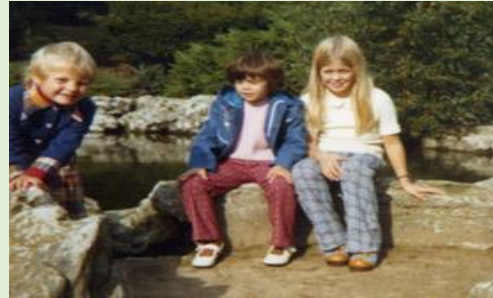
Elementary school days Hanging out with my little sisters

I made and served fresh squeezed orange juice while standing in a giant orange in the middle of the food court in Yorkdale Mall.