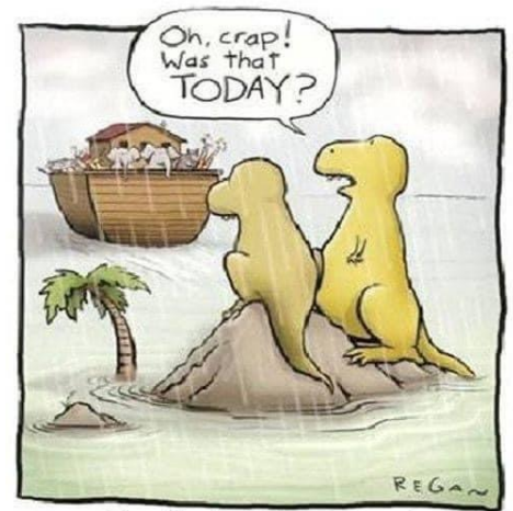
The first senior moment.