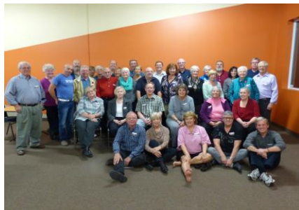
1st game held Tuesday, November 3, 2015