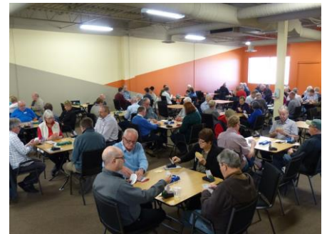
1st Swiss Teams Tournament held Sunday, November 8, 2015